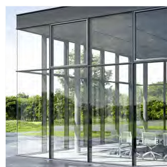
03 - Schueco FW550 Aluminium glazing facade system integral blind system for solar control double or triple glazing. Frame system target u-value of 0.9W/m 2 K or better