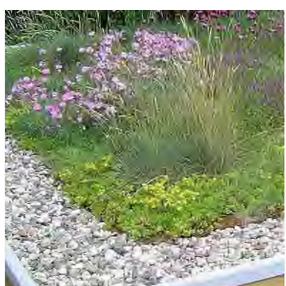
06 - Sedum roof with gravel perimeter drainage and internal drainage