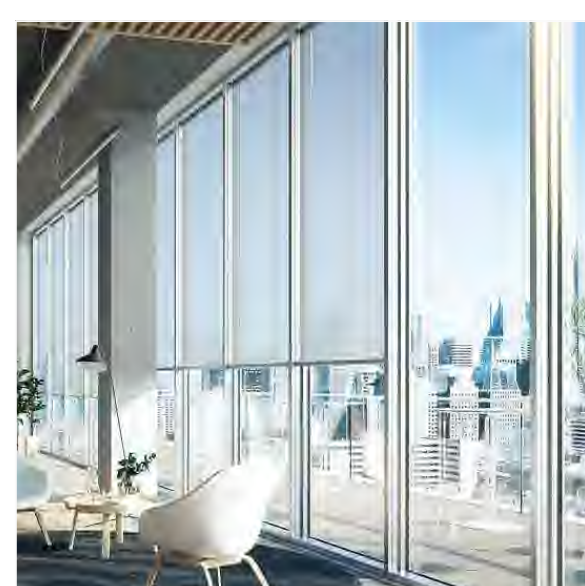
04 - Schueco FW550 Aluminium glazing facade system integral blind system for solar gain & glare control. Colour TBC and transparency levels subject to detail calculations