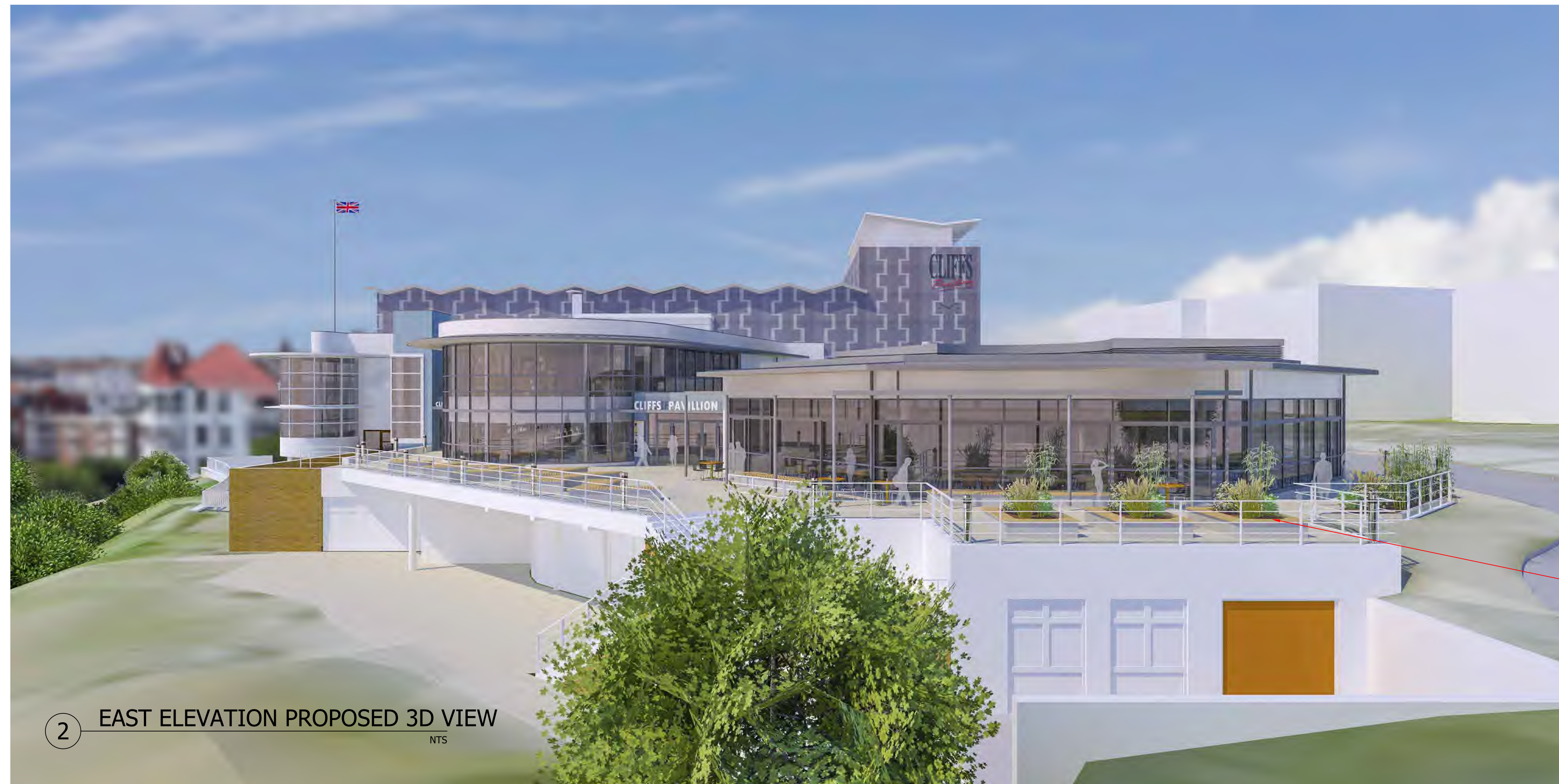
2 EAST ELEVATION PROPOSED 3D VIEW NTS