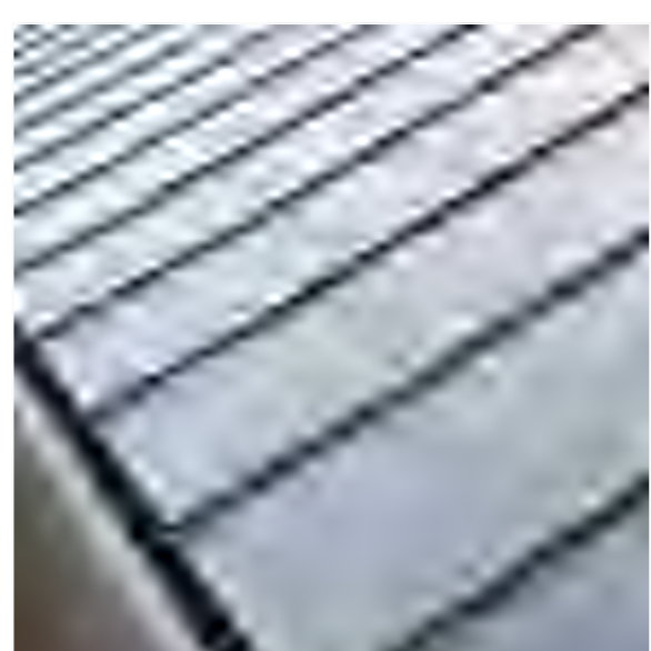
05 - Zinc (or equiv) standing seam roof cladding with integral concealed gutter in Dark Grey