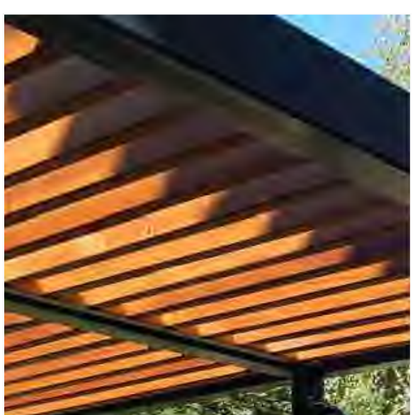
07 - vertical timber slat canopy set into dark grey metal frame to match glazing system