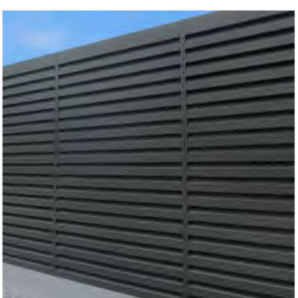
08 - Dark Grey acoustic louvres colour matched to zinc roof finish (05)

Outline of area being altered or extended