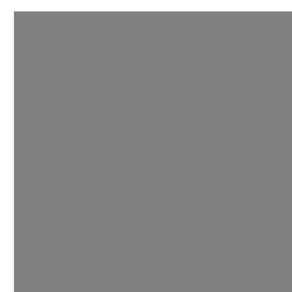
02 - Exterior Grade Ceramic Wall Tile (Colour TBC) with matching grout colour - High impact resistance - frost proof - marine grade